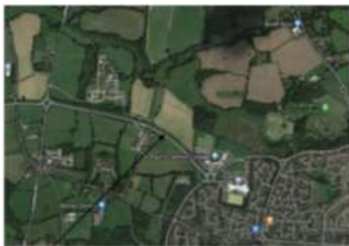
Proposed Camera site

Fixed Site ANPR camera (£7,000), intelligent single lane reading Vector camera with infrastructure in place for single carriageway road. - Vector camera x 1 £5, 000. Installation and setup cost £2,000